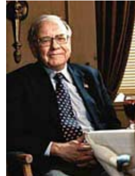
The Oracle of Omaha in his office building

What's in the future for investors--another roaring bull market or more upset stomach? Amazingly, the answer may come down to three simple factors. Here, the world's most celebrated investor talks about what really makes the market tick--and whether that ticking should make you nervous.